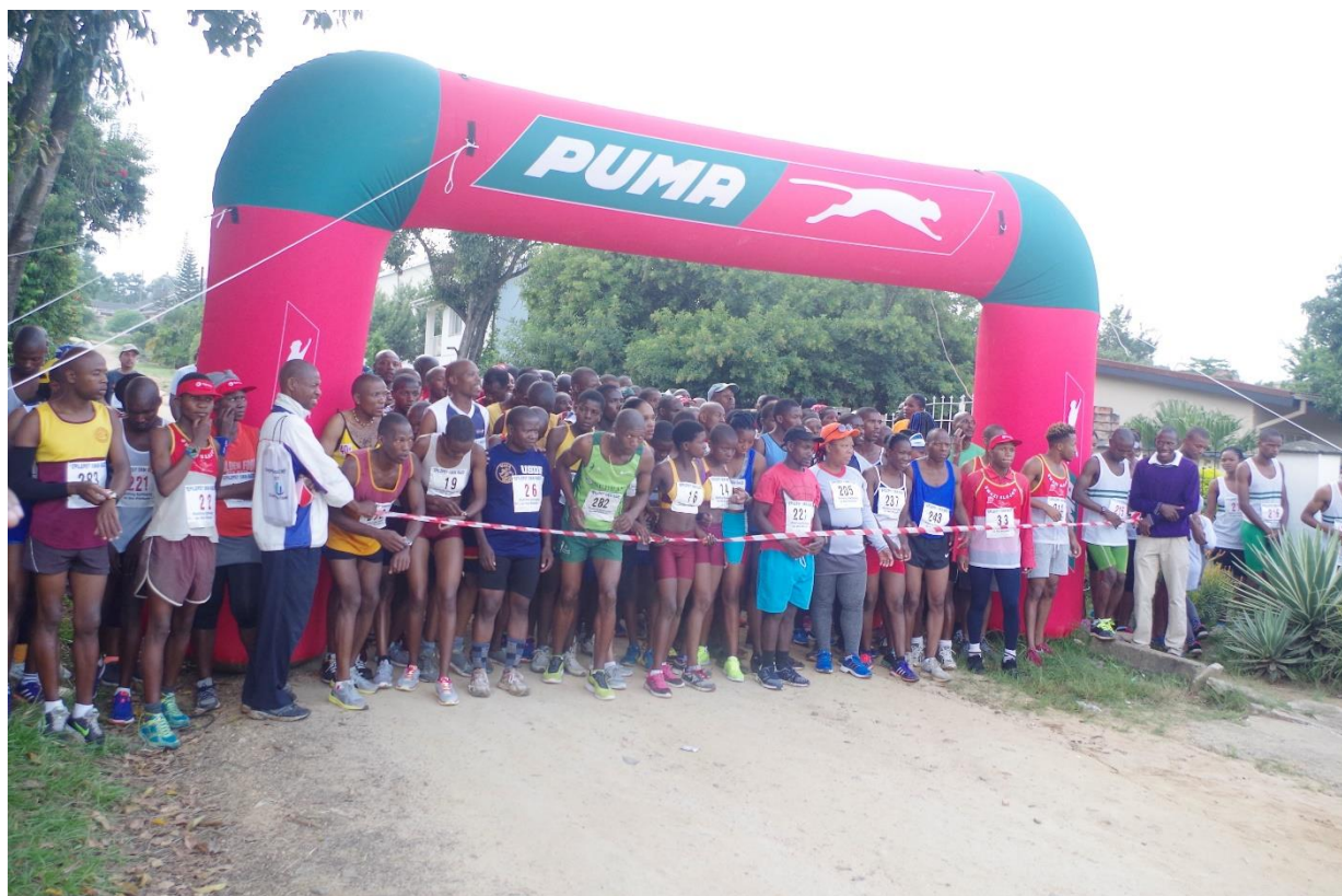
Some of the 263 athletes at the starting point at Manzini Club.

The Inaugural Epilepsy 10 KM Race was held on Sunday, 2 April 2017 at the Manzini Club Sports Ground under the theme: 'Putting epilepsy in the picture'. The race began at 6:30 am and finished at 7:30 am. The 10 KM race started at the Manzini Club, went through Mangwaneni bypass road, passed through Mavuso Sports Center, Coates Valley, and back to the starting point. The 5 KM race started from Manzini Club Stadium, passed through Body Parts Centre, St. Theresa, Hub, Coates Valley, and back to the starting point.